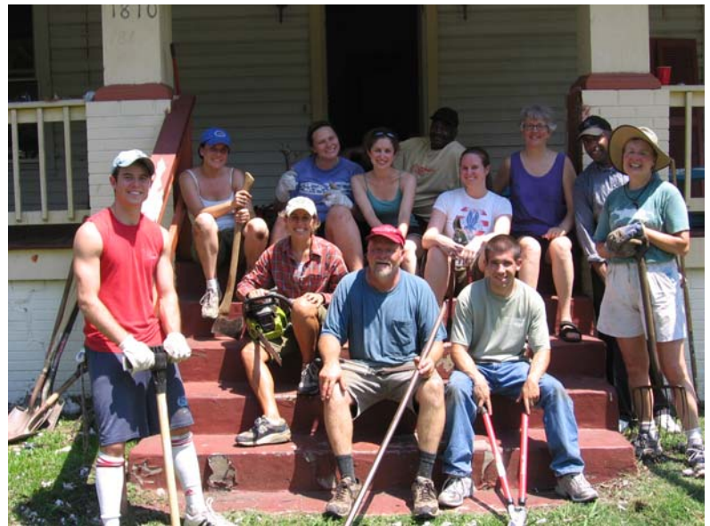
DCLT hosted a community work project with a small group of volunteers during National NeighborWorks Week.

NeighborWorks, a nationwide network of more than 240 trained and certified community development organizations that work in more than 4,000 communi-